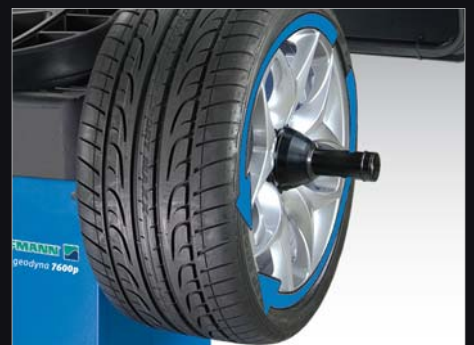
STOP IN POSITION